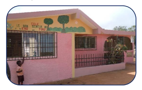
Left: Original building.

In 2009 FCH started an elementary school in a small refurbished house in a rural area of southern Haiti. In its first year the school ran with 3 classes: Kindergarten, Grade 1, Grade 2. Each year another grade was added. In 2011 a small annex was added and in 2013 another wing was built.