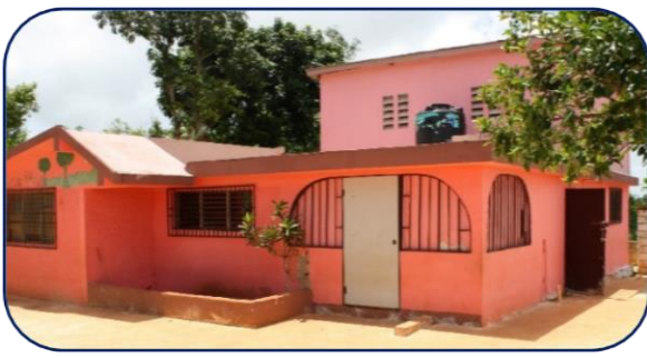
Above: Original building in front, wing