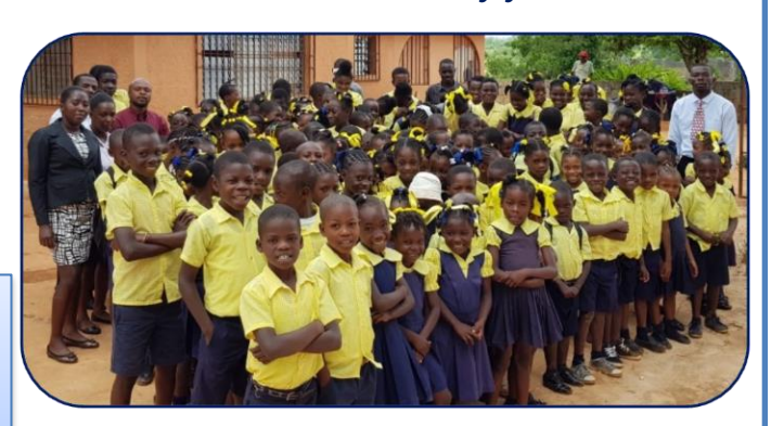
Some of the children and teachers at Mussotte elementary

To mark CFCH's 30<sup>th</sup> anniversary we would like to raise enough to cover the cost of this project, which will allow more children in the area to attend school for many years to come.