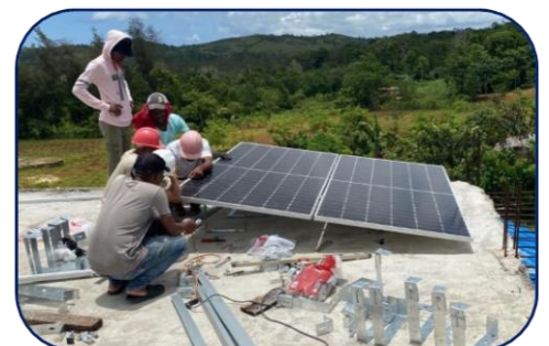
C-Tech students installing solar panels