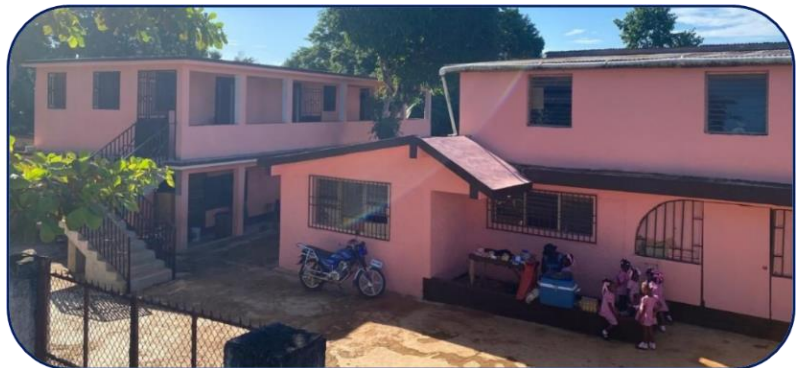
Mussotte Elementary. The expanded annex is on the left.