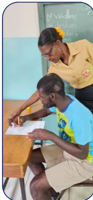
Special Ed Class