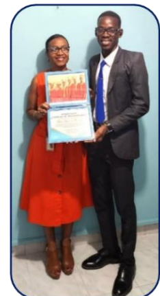
Left: Nursing grad at capping ceremony. Center: 6 high school grads.