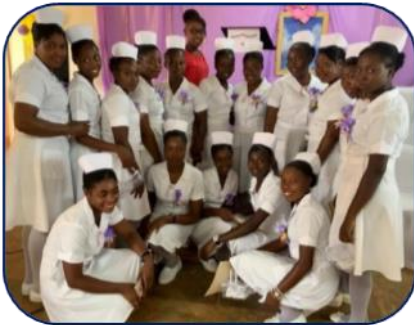
C-tech Nursing Grads

• Having the ability to fill tanks will reduce costs and assure adequate oxygen supplies.