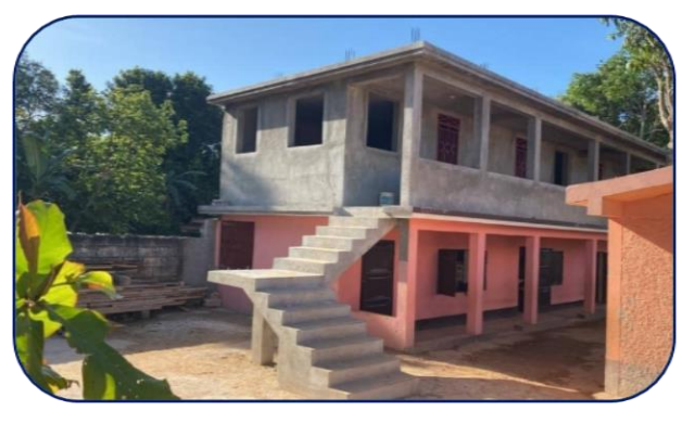
Expansion of the annex nears completion

Thanks to your generosity, CFCH was able to send down funds to complete this work.